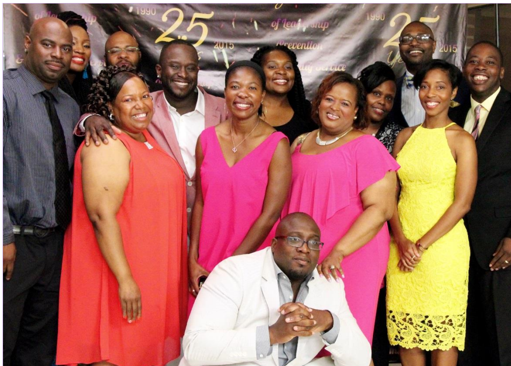
Guiding and Nurturing Teenagers For Twenty-Five Years